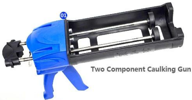
Two Component Caulking Gun