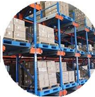
Kayan Kayan Kayan Kayan Gaskiya