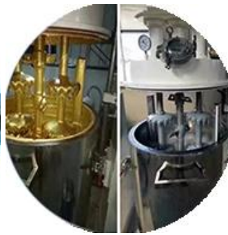
Bayanin sarrafa batutuwa