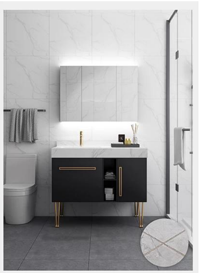
Samar da cikakkiyar hanyar daki