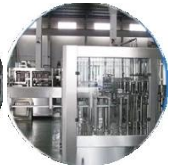
Sanyi mai sanyaya