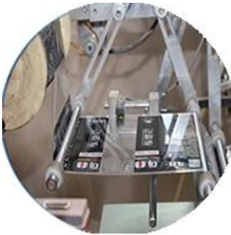
Mashin mai rufi