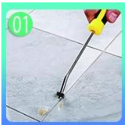
Tsaftace fale-falen buraka kuma ci gaba da bushe.