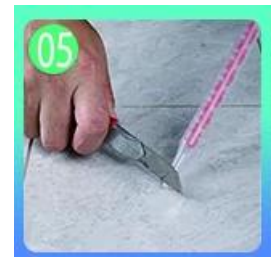
Karkatar da sutturar saman bututun karfe a cikin 45 °.