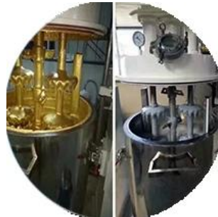
Bayanin sarrafa batutuwa