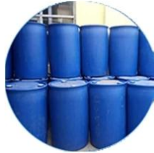
Kayan Kayan Kayan Kayan Gaskiya