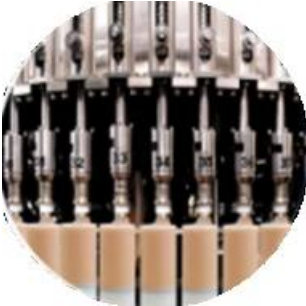
Cika layin injin