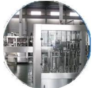
Sanyi mai sanyaya