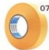
07 Masking Tape