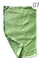
07 Scouring Pad