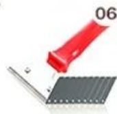
06 Perching Knife