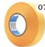
07 Masking Tape