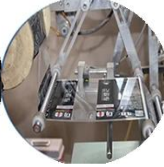
Mashin mai rufi