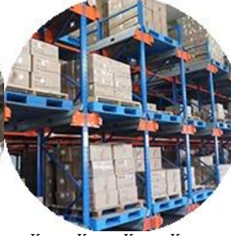
Kayan Kayan Kayan Kayan Gaskiya