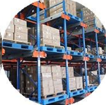
Kayan Kayan Kayan Kayan Gaskiya