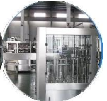
Sanyi mai sanyaya