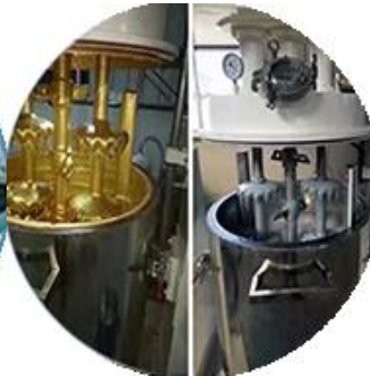
Bayanin sarrafa batutuwa