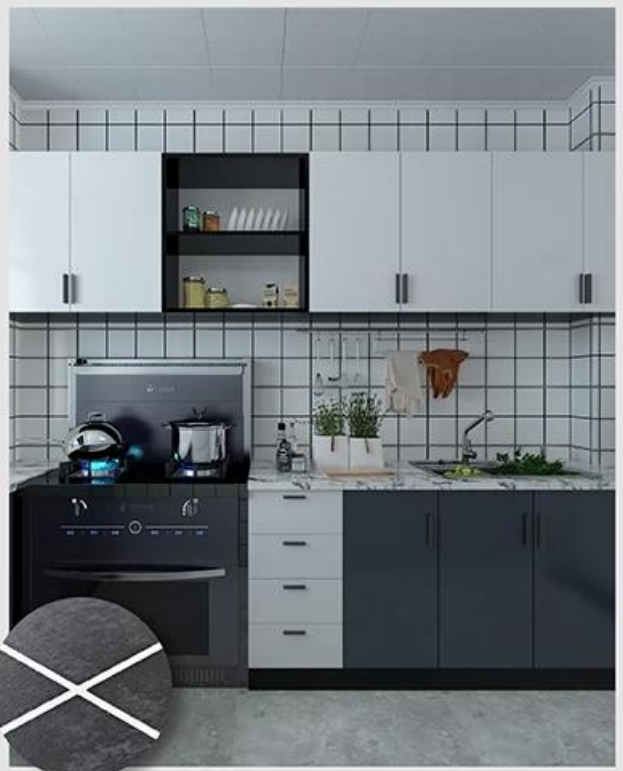
Bayar da Maganin Tazarar Dukan Room