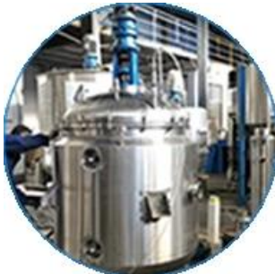
Layin Na'urar Yin Kuka