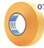
07 Masking Tape