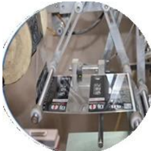
Injin da aka lullube da fim