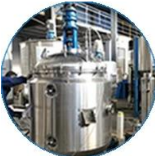
Layin Na'urar Yin Kuka