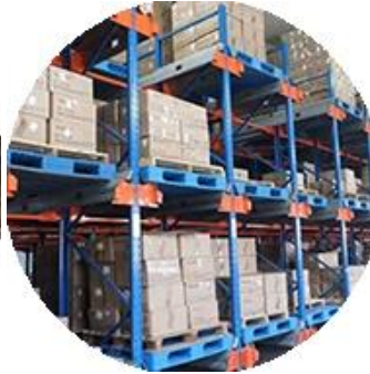
Kayan Kayan Kayan Kayan Gaskiya