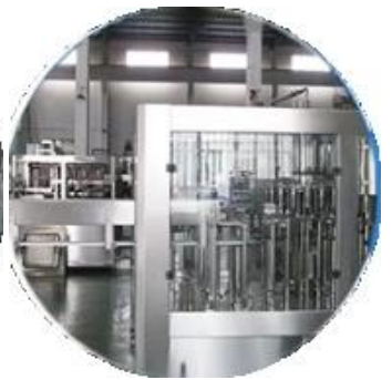
Sanyi mai sanyaya