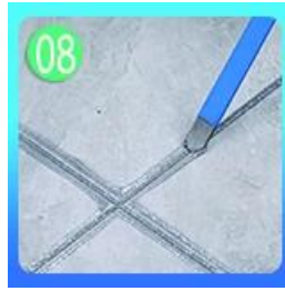
Latsa mafi girma tare da kayan aikin glue-latsa kayan aikin.