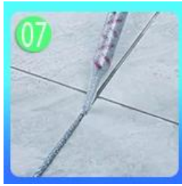
A koda a matse fitar da wakilin tilla tare da rata.