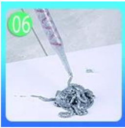
Matsi na agogon 60-80cm mai tsawo a cikin rokon.