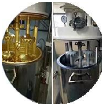
Bayanin sarrafa batutuwa