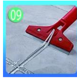
Don tabawa a cikin 4-5 hours kuma cire wuce haddi ko wuce haddi.