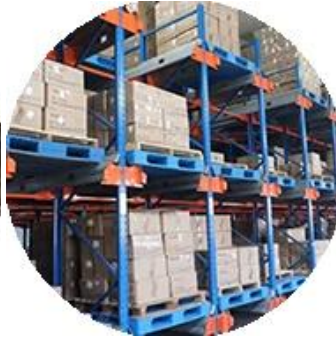
Kayan Kayan Kayan Kayan Gaskiya