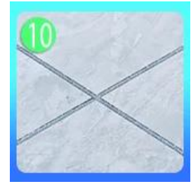
Rike fale-falen buraka bushe a cikin awanni 24.