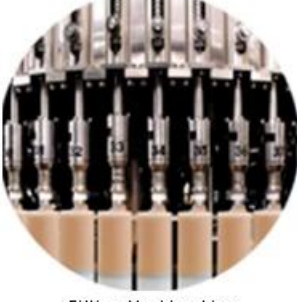
Filling Machine Line