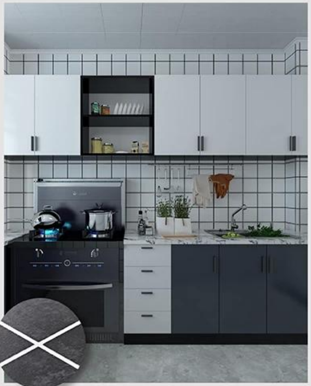
Samar da Maganin Tazarar Daki Gabaɗaya