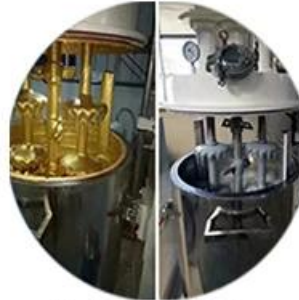
Batching Production Line