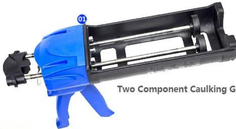
Two Component Caulking Gun