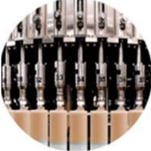
Filling Machine Line