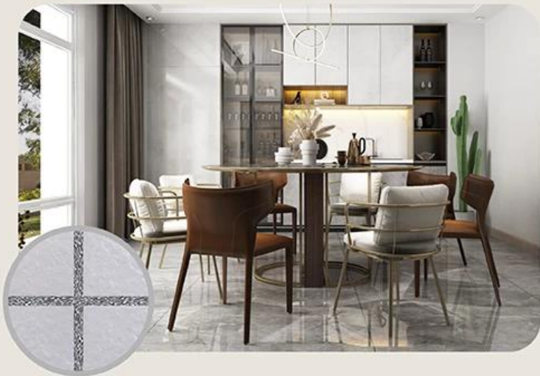
Bayar da Maganin Tazarar Dukan Room