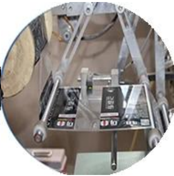
Mashin mai rufi