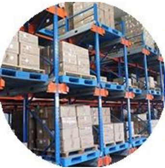
Kayan Kayan Kayan Kayan Gaskiya