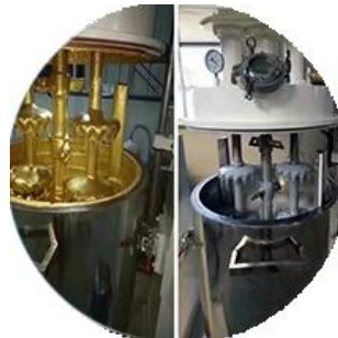
Layi Production Line