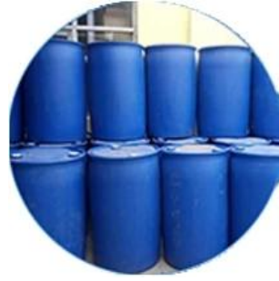
Kayan Kayan Kayan Kayan Gaskiya