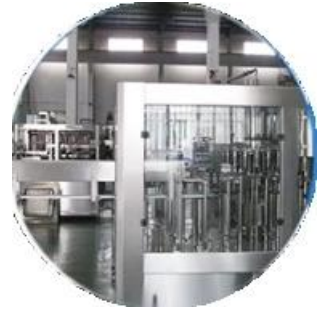
Sanyi mai sanyaya