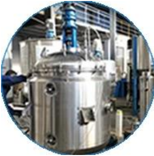
Layin injin cream