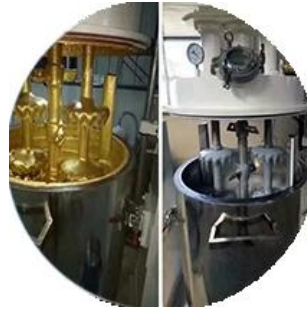
Bayanin sarrafa batutuwa