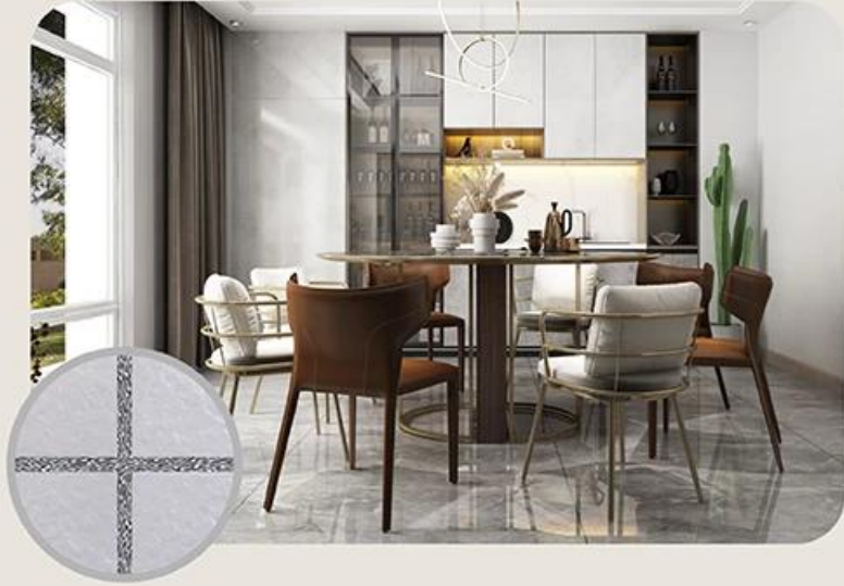
Samar da cikakkiyar hanyar daki