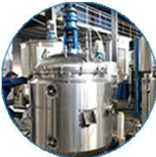
Layin Na'urar Yin Kuka