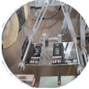
Injin da aka lullube da fim