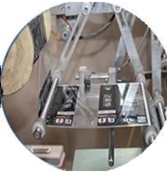
Mashin mai rufi