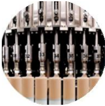
Cika layin injin