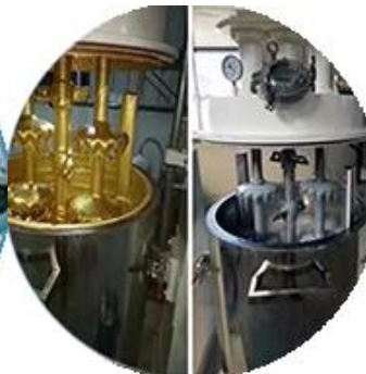
Bayanin sarrafa batutuwa