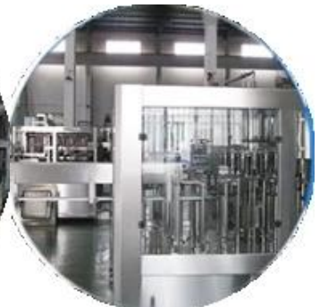
Sanyi mai sanyaya