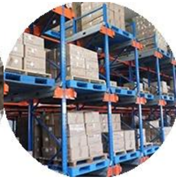
Kayan Kayan Kayan Kayan Gaskiya