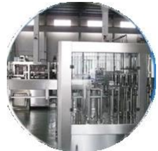
Sanyi mai sanyaya