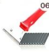
06 Perching Knife