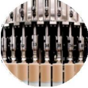
Cika layin injin