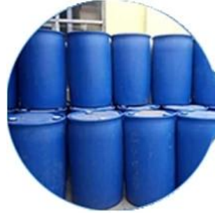
Kayan Kayan Kayan Kayan Gaskiya