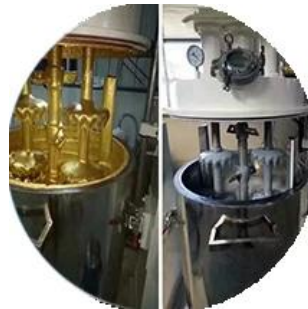
Bayanin sarrafa batutuwa