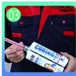
Bude & agonch, bangarorin biyu za su iya karfe, sa a kan babbar lalata da ake ciki.