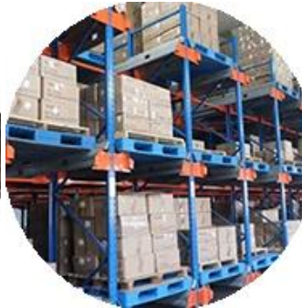
Kayan Kayan Kayan Kayan Gaskiya