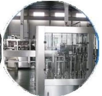
Sanyi mai sanyaya