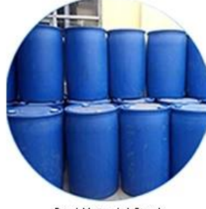
Raw Material Stock