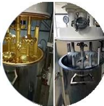
Bayanin sarrafa batutuwa