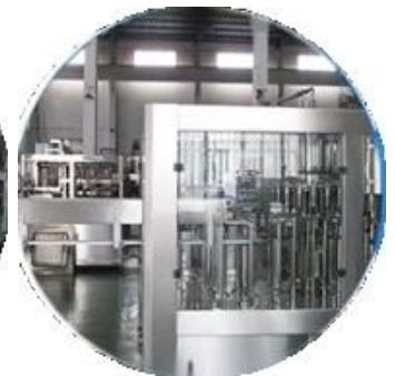
Sanyi mai sanyaya