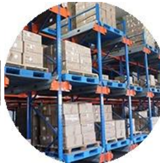
Kayan Kayan Kayan Kayan Gaskiya