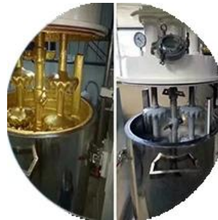
Layi Production Line