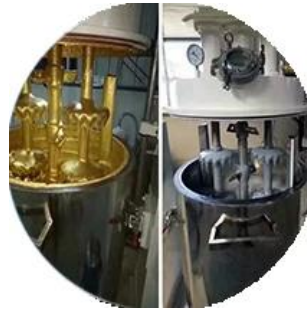
Bayanin sarrafa batutuwa