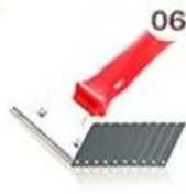
06 Perching Knife