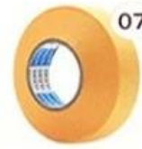
07 Masking Tape