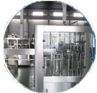
Sanyi mai sanyaya