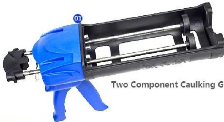
Two Component Caulking Gun