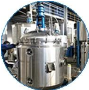
Layin Na'urar Yin Kuka