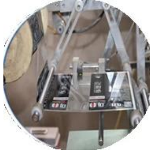
Injin da aka lullube da fim