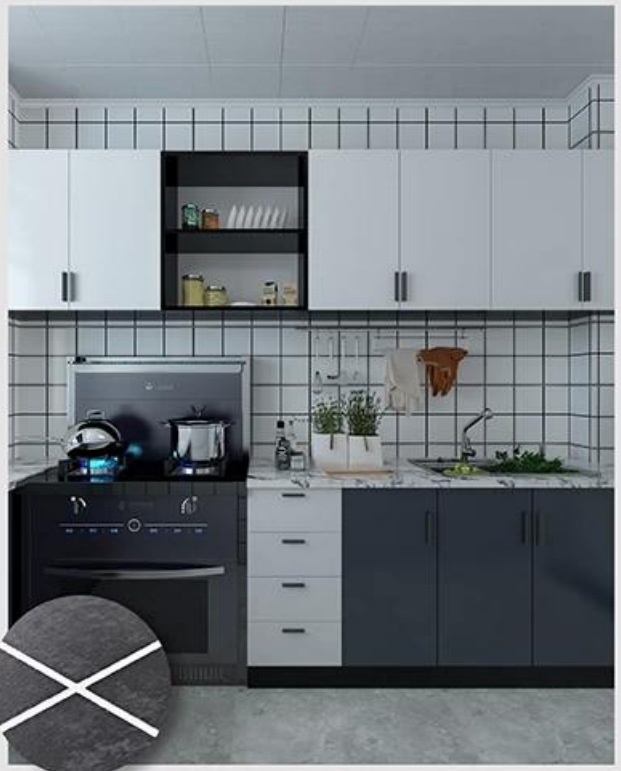
Samar da cikakkiyar hanyar daki