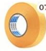
07 Masking Tape