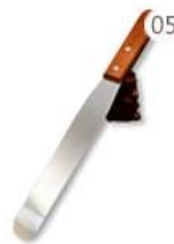
05 Stirring Knife