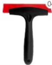
04 Rainbow Scraper