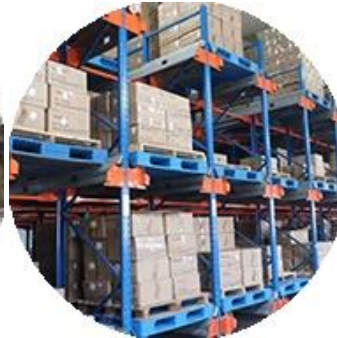
Kayan Kayan Kayan Kayan Gaskiya