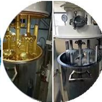
Bayanin sarrafa batutuwa