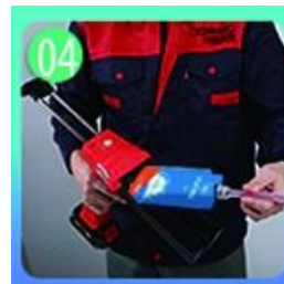
Dunkule a kan bututun saman bututun karfe a cikin 45 °.