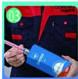
Bude & agonch, bangarorin biyu za su iya karfe, sa a kan babbar lalata da ake ciki.