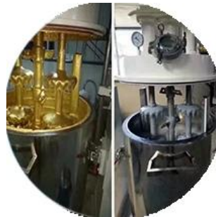
Bayanin sarrafa batutuwa