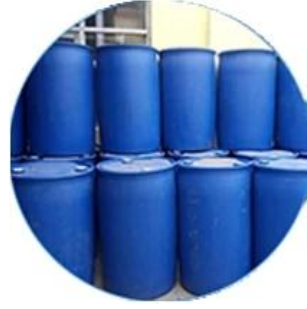
Kayan Kayan Kayan Kayan Gaskiya