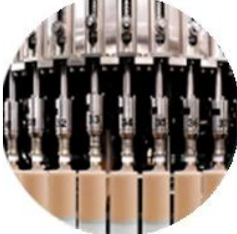
Cika layin injin