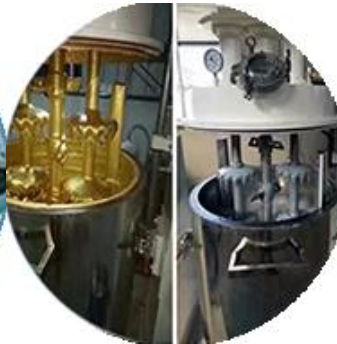
Bayanin sarrafa batutuwa