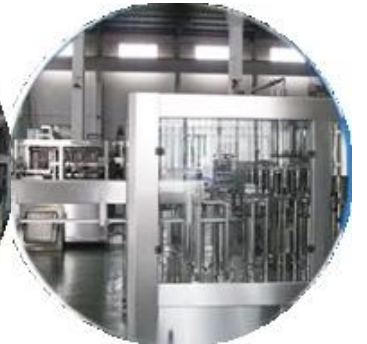
Sanyi mai sanyaya