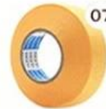
07 Masking Tape