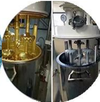
Bayanin sarrafa batutuwa