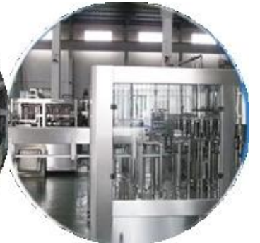
Sanyi mai sanyaya