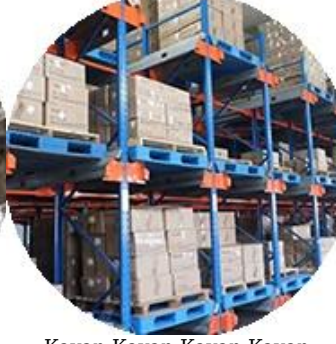
Kayan Kayan Kayan Kayan Gaskiya