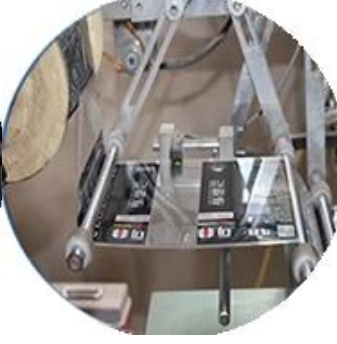
Mashin mai rufi