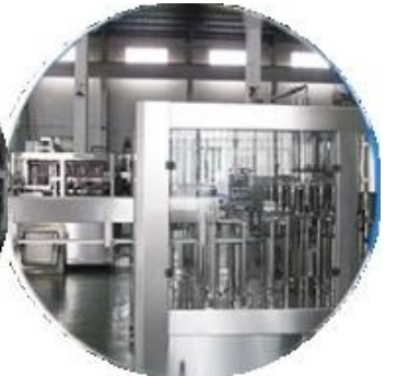
Sanyi mai sanyaya