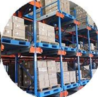
Kayan Kayan Kayan Kayan Gaskiya