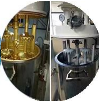
Bayanin sarrafa batutuwa