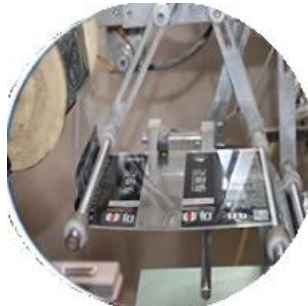
Injin da aka lullube da fim