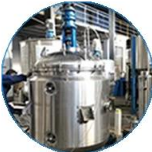
Layin Na'urar Yin Kuka