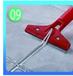
Don tabawa a cikin 4-5 hours kuma cire wuce haddi ko wuce haddi.