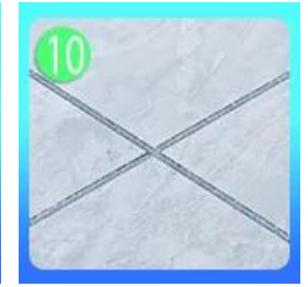
Rike fale-falen buraka bushe a cikin awanni 24.