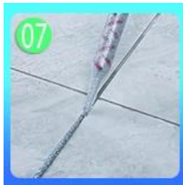
A koda a matse fitar da wakilin tilla tare da rata.