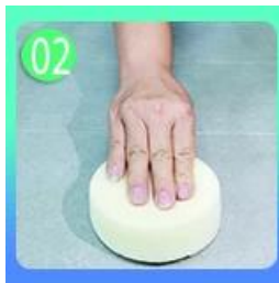
Yaren mutanen Poland tare da kakin zuma na tie sai dai da glazed tayal.