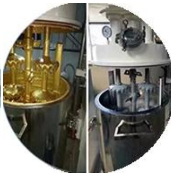
Bayanin sarrafa batutuwa