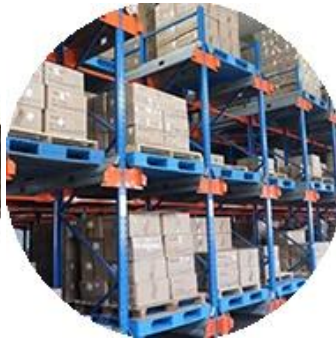
Kayan Kayan Kayan Kayan Gaskiya