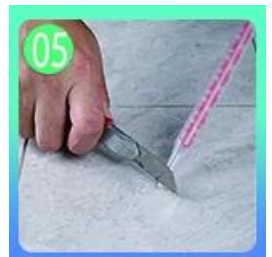
Karkatar da suturar saman bututun karfe a cikin 45 °.