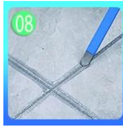
Latsa mafi girma tare da kayan aikin glue-latsa kayan aikin.