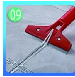
Don tabawa a cikin 4-5 hours kuma cire wuce haddi ko wuce haddi.