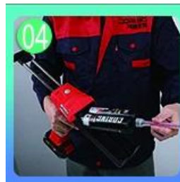
Dunkule a kan bututun saman bututun karfe, sa a kan babbar bindiga.