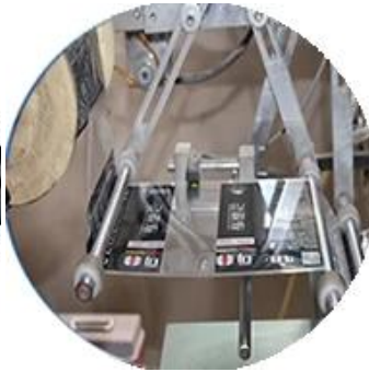
Mashin mai rufi