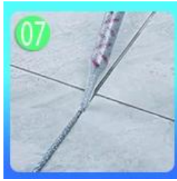
A koda a matse fitar da wakilin tilla tare da rata.