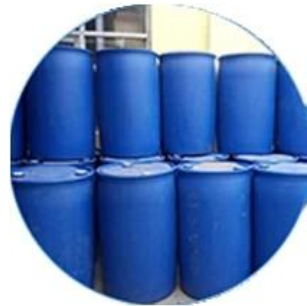
Kayan Kayan Kayan Kayan Gaskiya