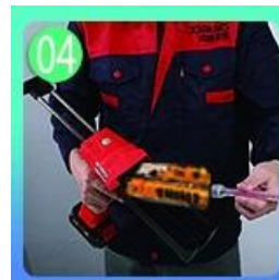
Dunkule a kan bututun saman bututun karfe a cikin 45°.