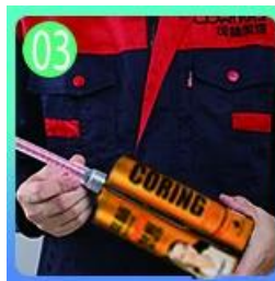
Bude & agonch, bangarorin biyu za su iya karfe, sa a kan babbar lalata da ake ciki.