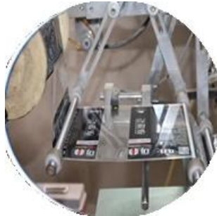
Injin da aka lullube da fim