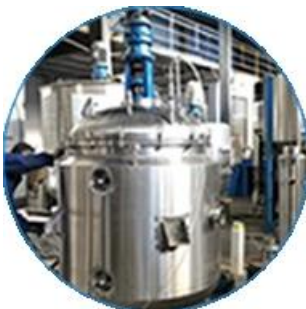
Layin Na'urar Yin Kuka