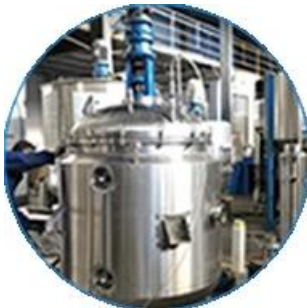
Layin Na'urar Yin Kuka