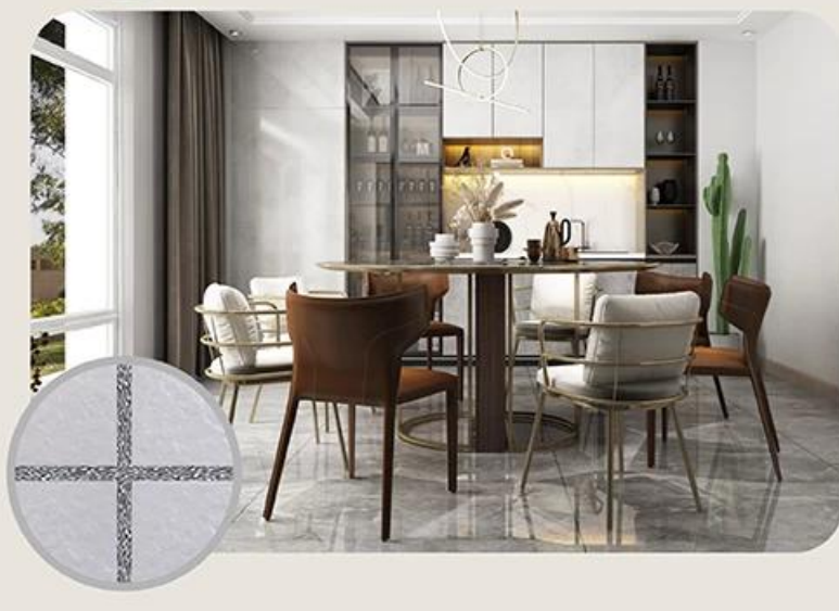
Bayar da Maganin Tazarar Dukan Room