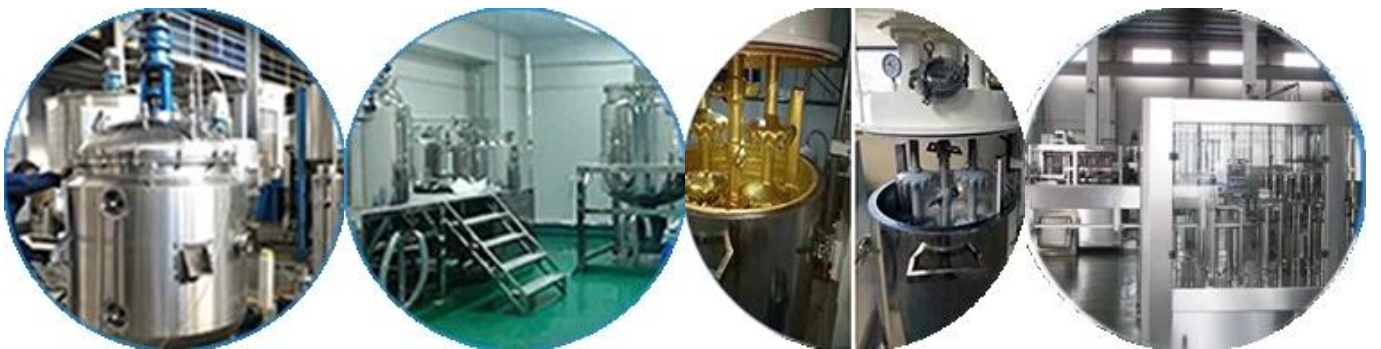
Layin injin cream