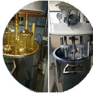
Layi Production Line