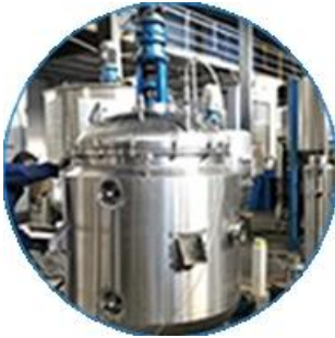
Layin Na'urar Yin Kuka