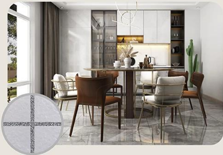
Samar da cikakkiyar hanyar daki