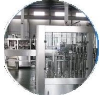
Sanyi mai sanyaya