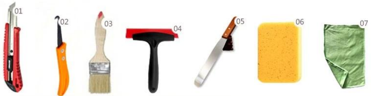
Cutter Knife | Pointing trowel | Brush | Rainbow Scraper | Stirring Knife | The sponge | Scouring Pad