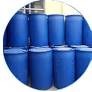
Kayan Kayan Kayan Kayan Gaskiya