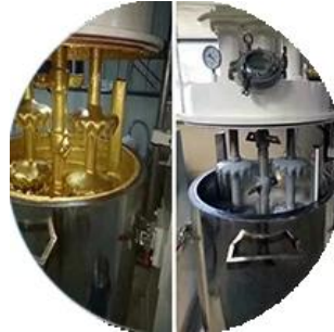
Bayanin sarrafa batutuwa