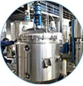
Creaming Machine Line